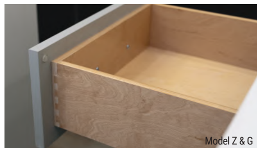
Model Z & G