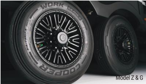
Model Z & G