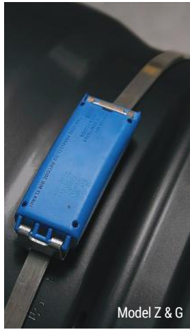
Model Z & G