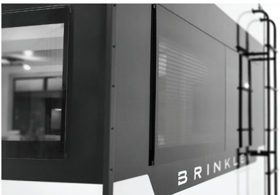
Model Z & G