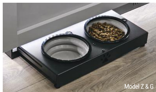
Model Z & G