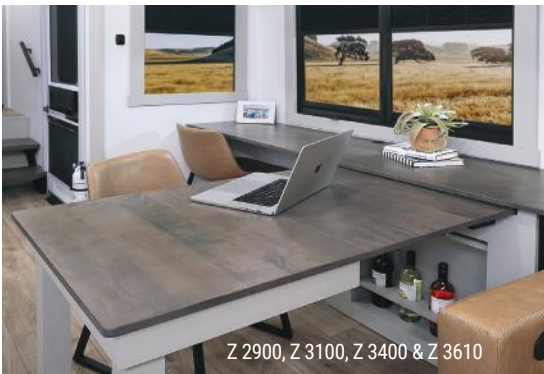
Z 2900, Z 3100, Z 3400 & Z 3610