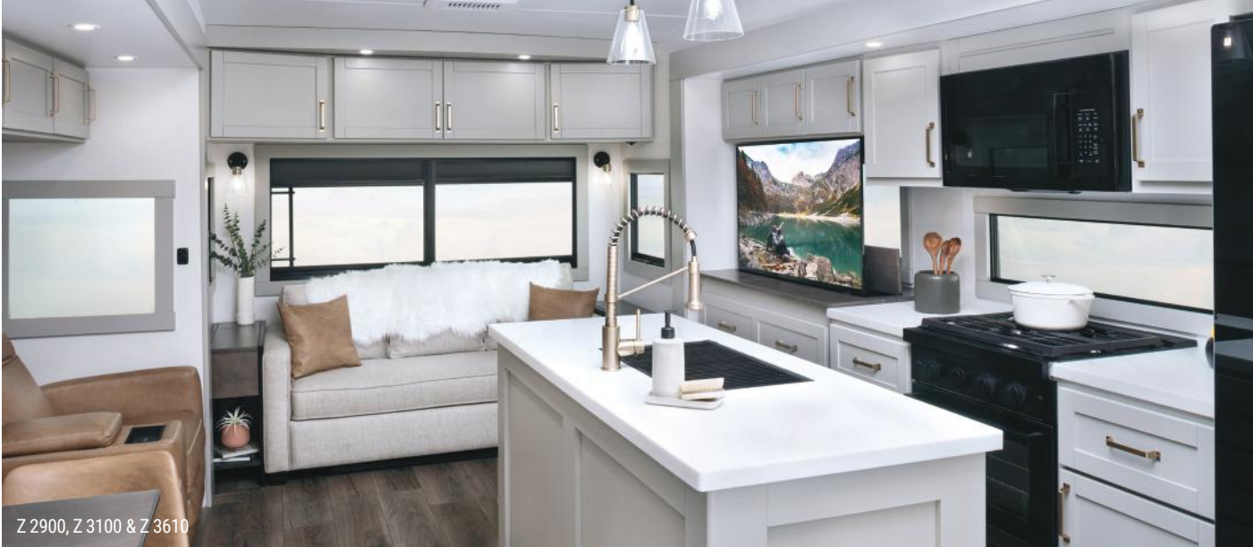
Z 2900, Z 3100 & Z 3610