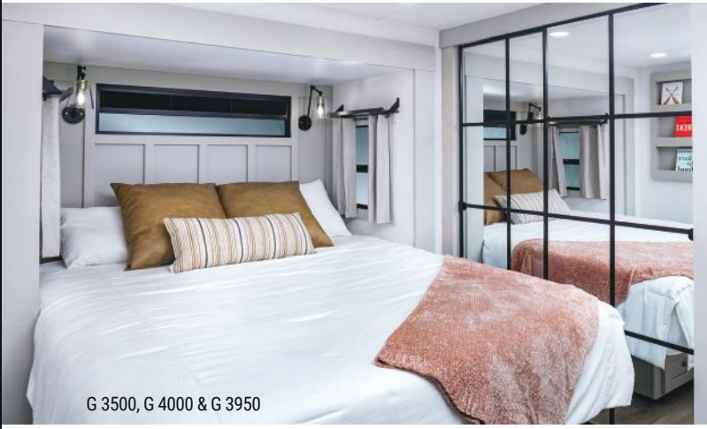
G 3500, G 4000 & G 3950